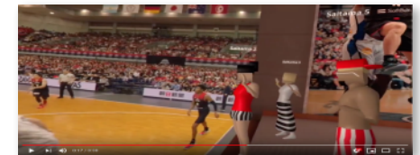
▶ SoftBank 5G VR Live ◀