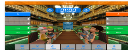
▶ Chungdam VR Education ◀