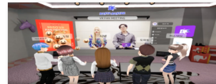
▶ KT Super VR ◀